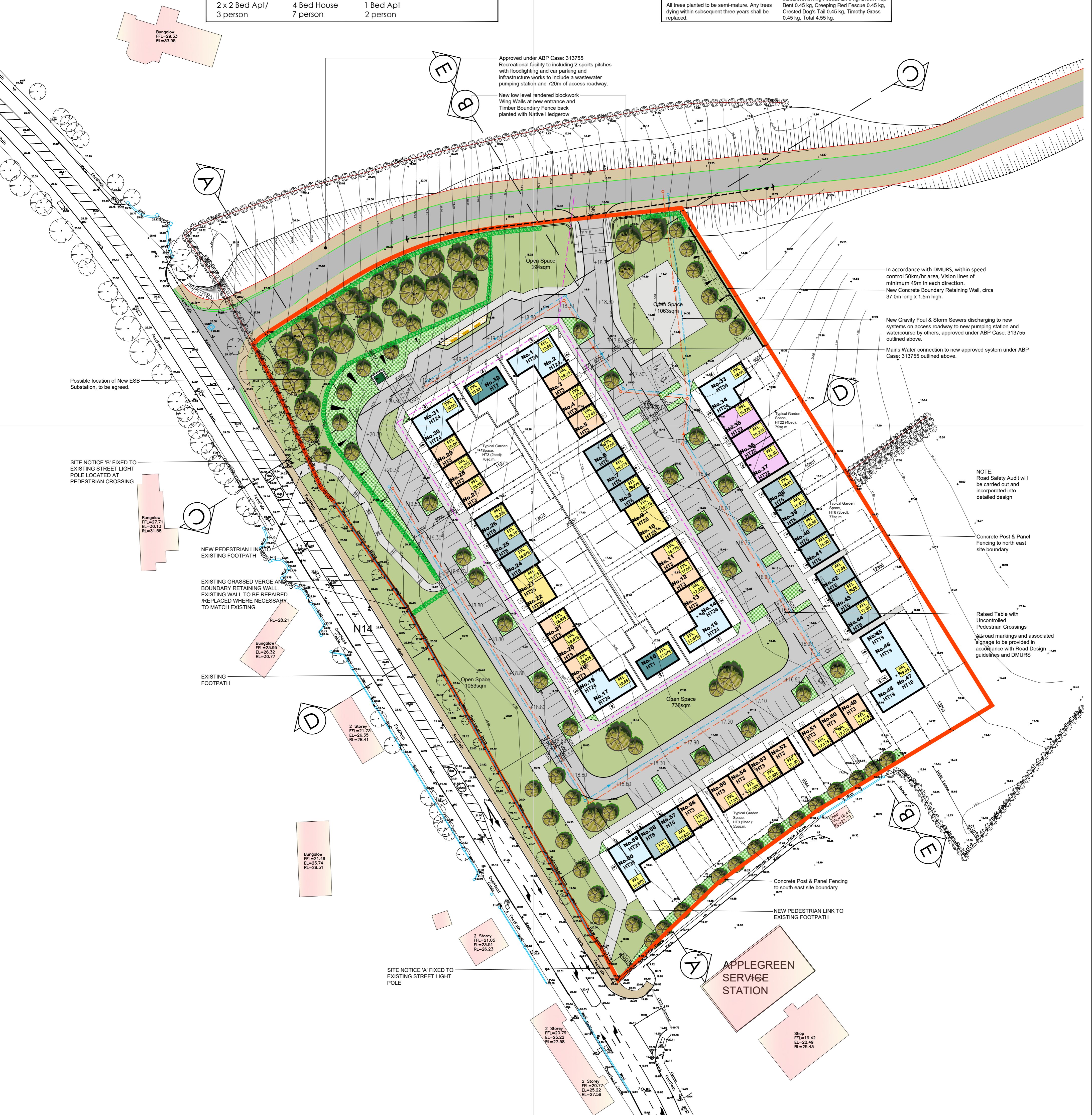
Site Layout Scale 1:500